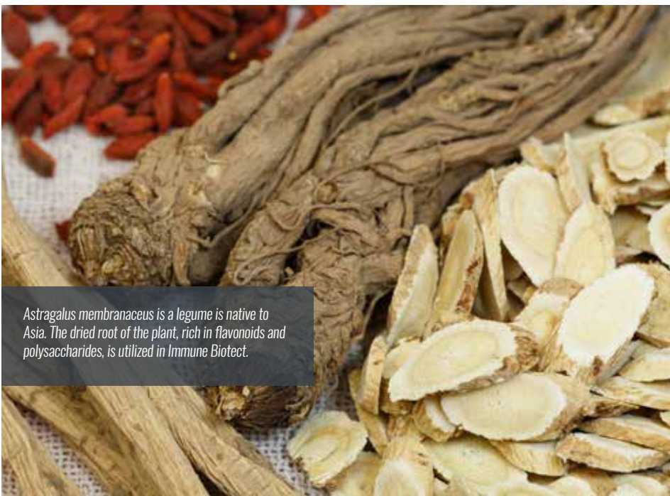
Astragalus membranaceus is a legume native to Asia. The dried root of the plant, rich in flavonoids and polysaccharides, is utilized in Immune Biotect.

“A NUTRITARIAN DIET RICH IN G-BOMBS™ (GREENS, BEANS, ONIONS, MUSHROOMS, BERRIES AND SEEDS) PROVIDES A WEALTH OF IMMUNE-SUPPORTING PHYTOCHEMICALS.”