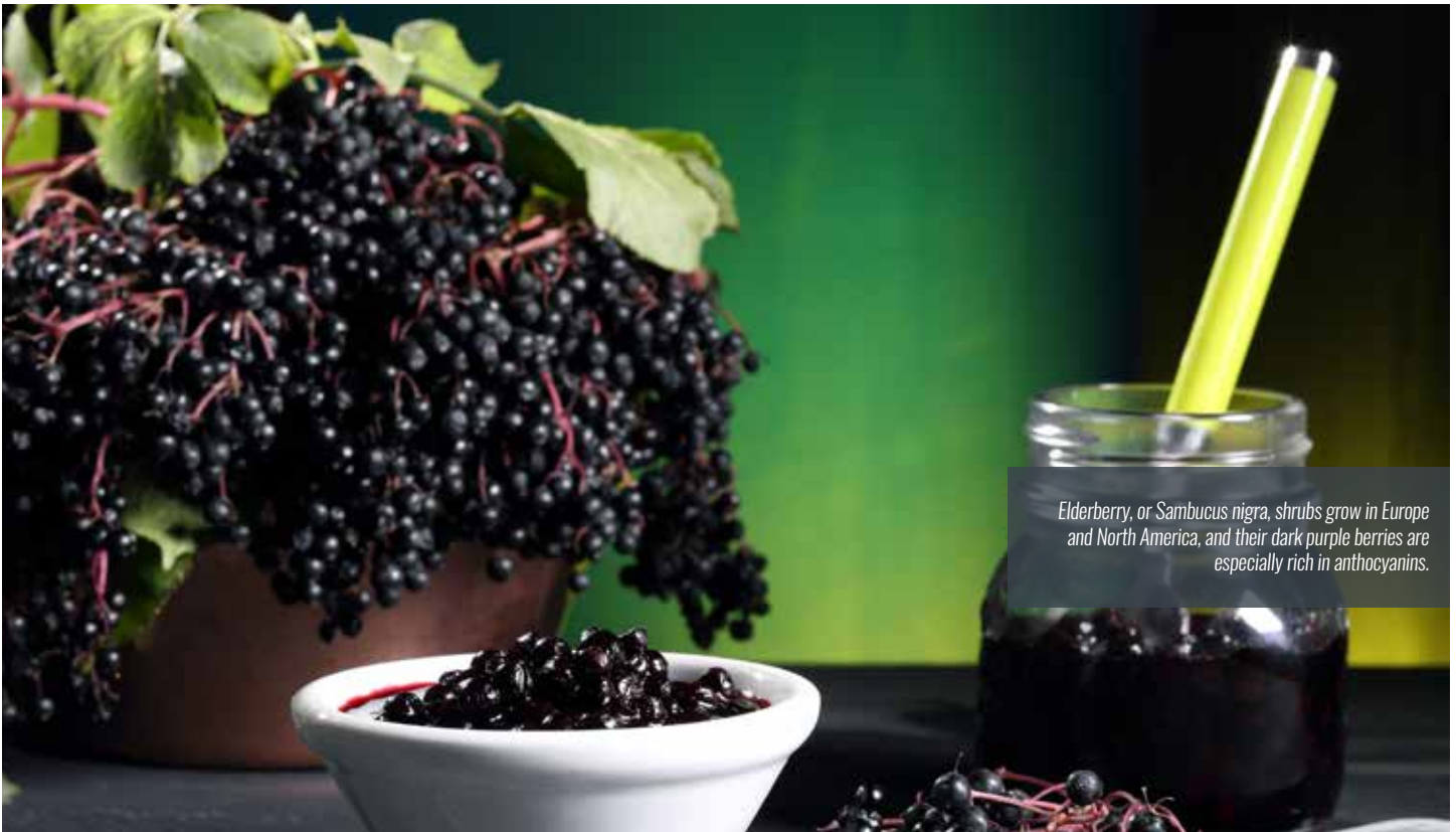
Elderberry, or Sambucus nigra , shrubs grow in Europe and North America, and their dark purple berries are especially rich in anthocyanins.